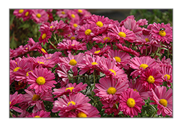
Lavender Daisy Chrysanthemum flowers