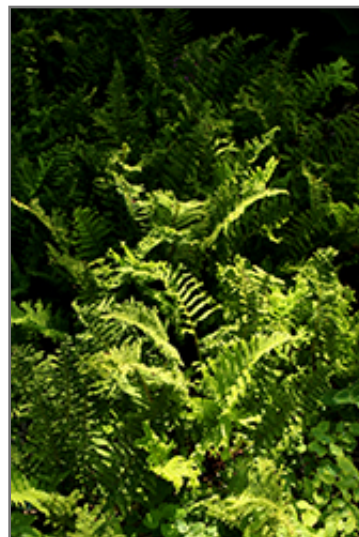
Lady Fern foliage