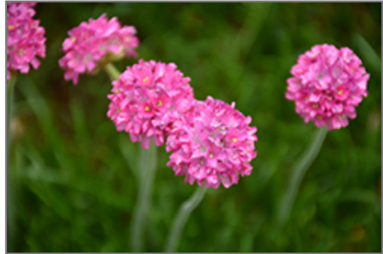
Bloodstone Sea Thrift flowers

Bloodstone Sea Thrift is a fine choice for the garden, but it is also a good selection for planting in outdoor pots and containers. It is often used as a 'filler' in the 'spiller-thriller-filler' container combination, providing a mass of flowers against which the thriller plants stand out. Note that when growing plants in outdoor containers and baskets, they may require more frequent waterings than they would in the yard or garden.