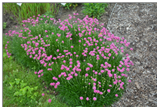
Bloodstone Sea Thrift in bloom