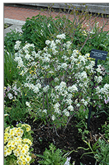
Helvetica Serviceberry in bloom