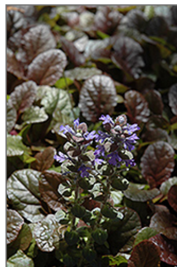
Purple Brocade Bugleweed flowers

Purple Brocade Bugleweed is recommended for the following landscape applications;