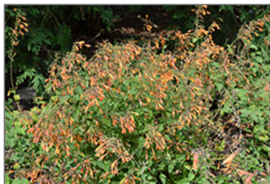
Apricot Sprite Hyssop in bloom