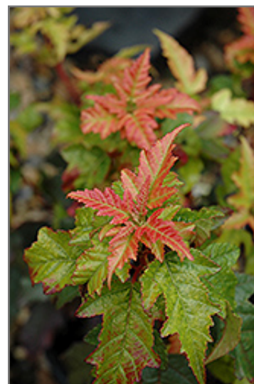
Atomic Amur Maple in fall