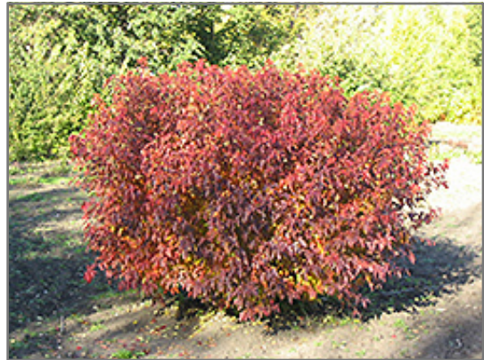
Atomic Amur Maple in fall

This shrub does best in full sun to partial shade. It is very adaptable to both dry and moist locations, and should do just fine under average home landscape conditions. It is not particular as to soil type or pH. It is highly tolerant of urban pollution and will even thrive in inner city environments. This is a selected variety of a species not originally from North America.