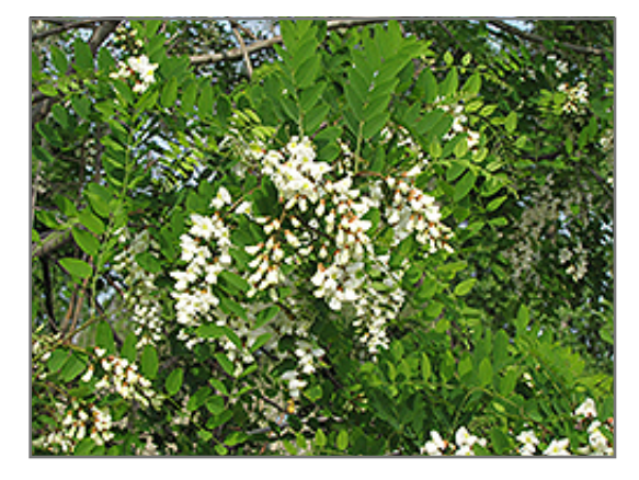
Black Locust flowers