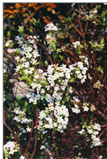
Mount Fuji Spirea flowers