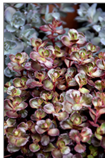
Voodoo Stonecrop foliage