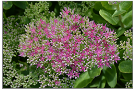
Neon Stonecrop flower buds

Neon Stonecrop will grow to be about 20 inches tall at maturity, with a spread of 20 inches. When grown in masses or used as a bedding plant, individual plants should be spaced approximately 16 inches apart. It grows at a fast rate, and under ideal conditions can be expected to live for approximately 15 years. As an herbaceous perennial, this plant will usually die back to the crown each winter, and will regrow from the base each spring. Be careful not to disturb the crown in late winter when it may not be readily seen!