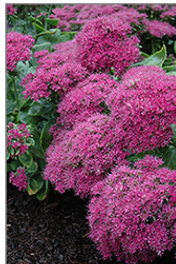
Neon Stonecrop flowers

Neon Stonecrop is recommended for the following landscape applications;