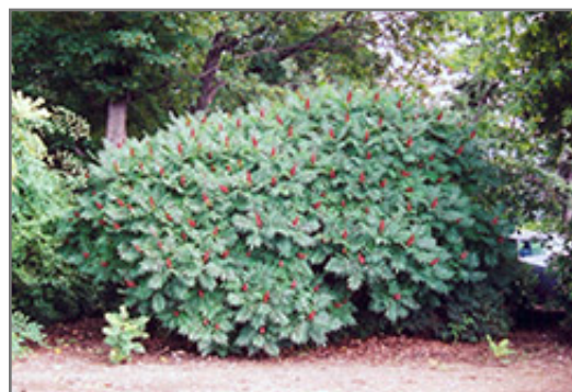
Smooth Sumac in bloom