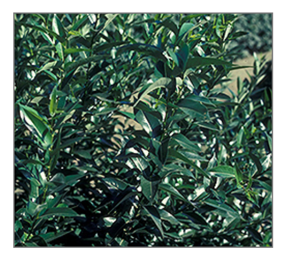
Prairie Reflection Willow foliage