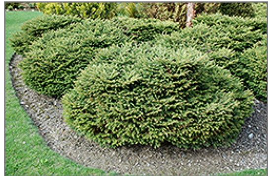
Creeping Norway Spruce