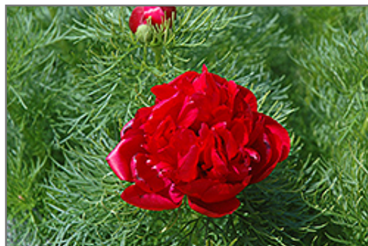
Double Fernleaf Peony flowers