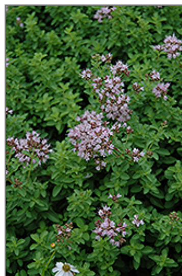
Dwarf Oregano flowers