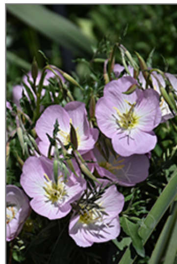
Evening Primrose flowers