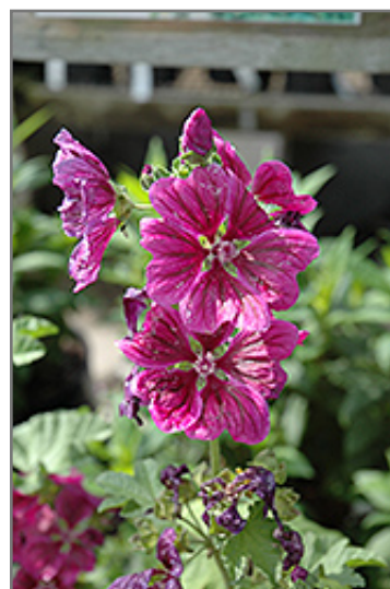
Tree Mallow flowers