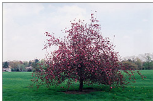
Ruby Luster Flowering Crab in bloom