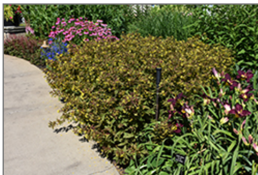
Purpleleaf Loosestrife in bloom