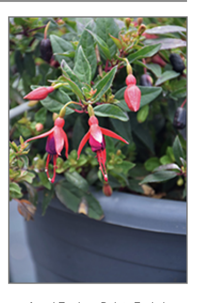
Angel Earrings Dainty Fuchsia flowers