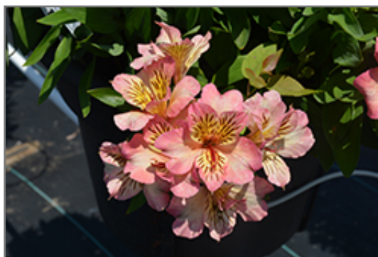
Inticancha Sunshine Alstroemeria flowers