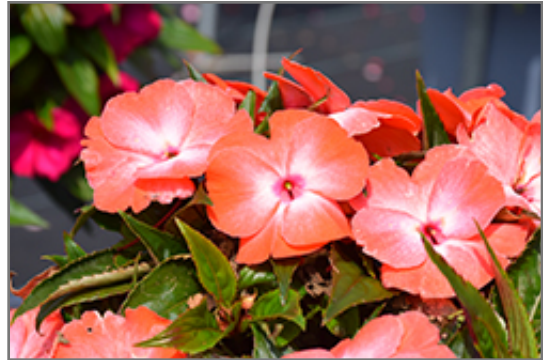
Petticoat Orange Orchid New Guinea Impatiens flowers