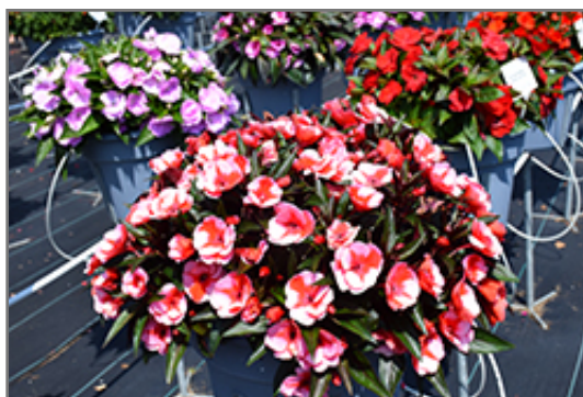
Petticoat Cherry Star New Guinea Impatiens in bloom