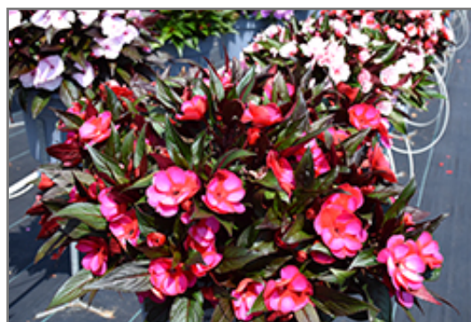
Petticoat Blue Star New Guinea Impatiens in bloom