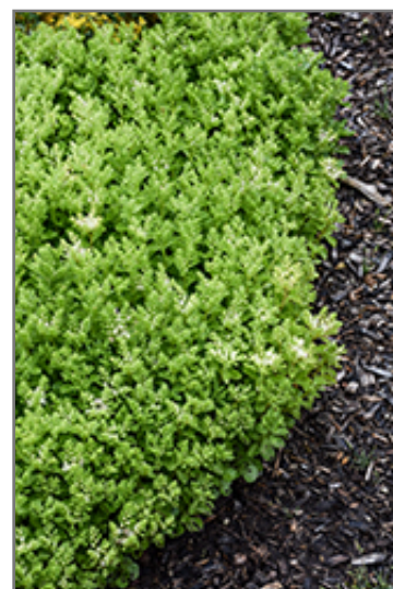
Summer Snow Stonecrop flowers

Summer Snow Stonecrop is recommended for the following landscape applications;