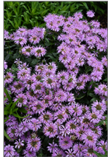
Leading Lady Lilac Beebalm flowers

Leading Lady Lilac Beebalm is recommended for the following landscape applications;