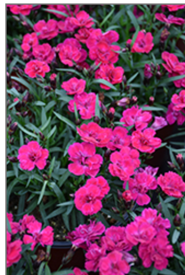
Beauties Tiiu Pinks flowers

Beauties Tiiu Pinks is recommended for the following landscape applications;