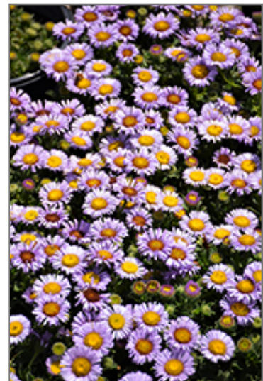
Cape Sebastian Seaside Daisy flowers