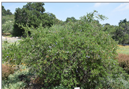
Ernie Bryant California Lilac in bloom