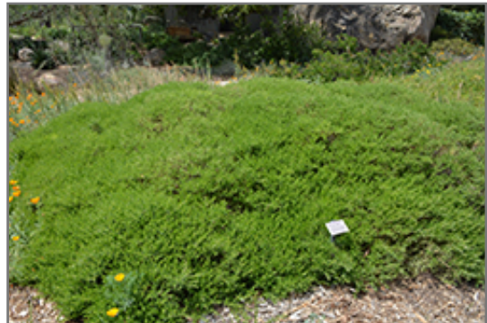
Santa Ana Coyote Brush