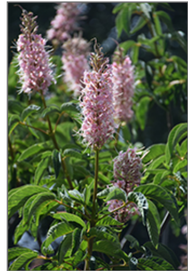
Canyon Pink California Buckeye flowers