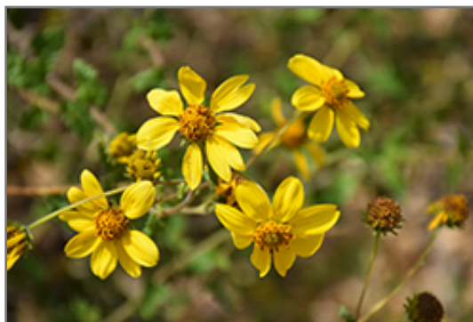
Parish's Goldeneye flowers

Parish's Goldeneye is recommended for the following landscape applications;