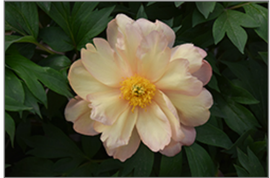
Singing in the Rain Peony flowers