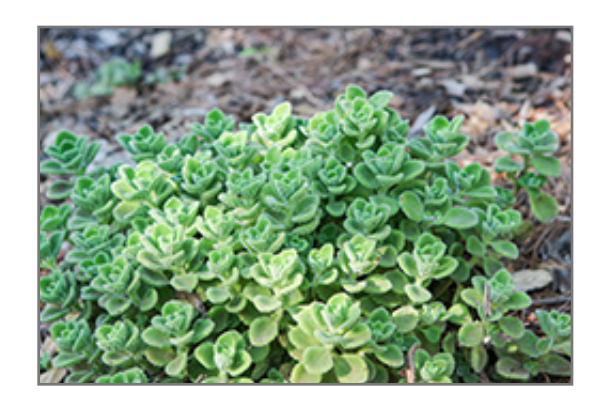
Mexican Mint