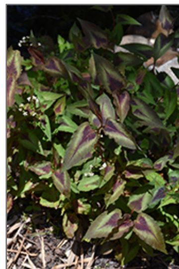
Pink Knotweed foliage