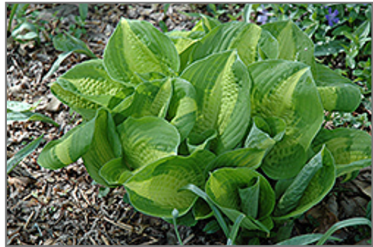
Summer Music Hosta

Summer Music Hosta will grow to be about 18 inches tall at maturity extending to 26 inches tall with the flowers, with a spread of 32 inches. When grown in masses or used as a bedding plant, individual plants should be spaced approximately 28 inches apart. Its foliage tends to remain dense right to the ground, not requiring facer plants in front. It grows at a medium rate, and under ideal conditions can be expected to live for approximately 10 years. As an herbaceous perennial, this plant will usually die back to the crown each winter, and will regrow from the base each spring. Be careful not to disturb the crown in late winter when it may not be readily seen!