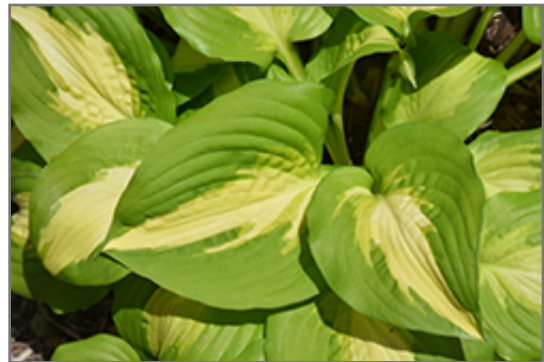
Summer Music Hosta foliage