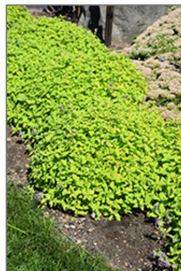
Chartreuse On The Loose Catmint

Chartreuse On The Loose Catmint is recommended for the following landscape applications;