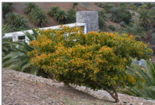
Rough Bark Lignum Vitae fruit

Rough Bark Lignum Vitae is recommended for the following landscape applications;