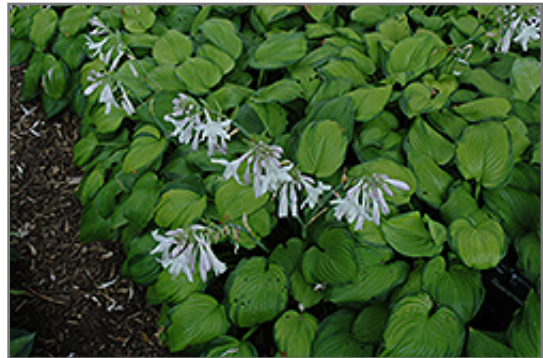
Guacamole Hosta in bloom

Guacamole Hosta will grow to be about 24 inches tall at maturity extending to 3 feet tall with the flowers, with a spread of 4 feet. When grown in masses or used as a bedding plant, individual plants should be spaced approximately 3 feet apart. Its foliage tends to remain dense right to the ground, not requiring facer plants in front. It grows at a medium rate, and under ideal conditions can be expected to live for approximately 10 years. As an herbaceous perennial, this plant will usually die back to the crown each winter, and will regrow from the base each spring. Be careful not to disturb the crown in late winter when it may not be readily seen!