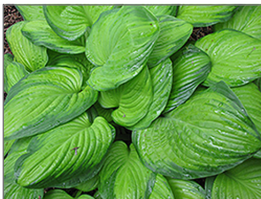
Guacamole Hosta foliage

Guacamole Hosta is recommended for the following landscape applications;