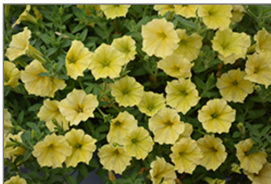
Supertunia Mini Vista Yellow Petunia flowers

Supertunia Mini Vista Yellow Petunia is recommended for the following landscape applications;