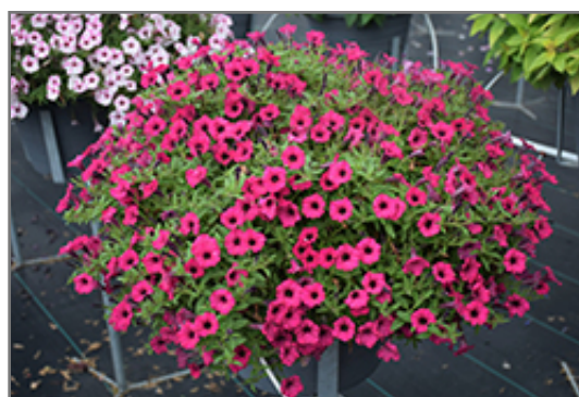
Supertunia Mini Vista Sweet Sangria Petunia in bloom