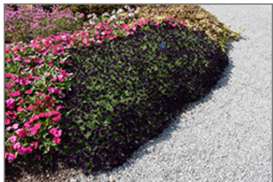
Supertunia Mini Vista Midnight Petunia in bloom