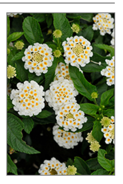
Evita White Lantana flowers