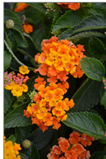
Evita Sunrise Lantana flowers