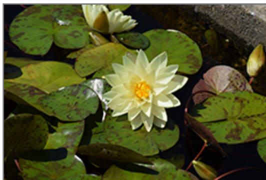
Lemon Chiffon Hardy Water Lily flowers