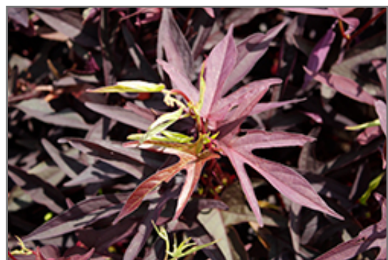
Sweet Caroline Upside Black Coffee Sweet Potato Vine foliage