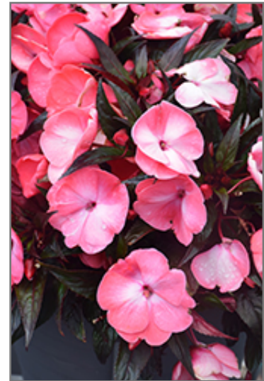
Infinity Salmon New Guinea Impatiens flowers

Infinity Salmon New Guinea Impatiens is recommended for the following landscape applications;