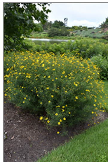
Tickseed in bloom