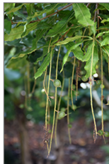
Beaumont Macadamia Nut fruit